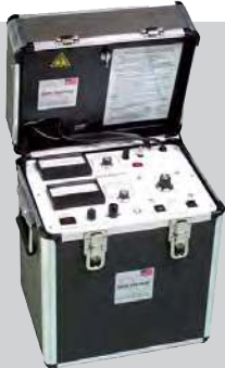
PTS-75 Model (0-75 kVdc, 10mA)

Two HV Portable DC Test Sets for the Price of One!