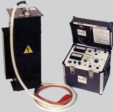
PTS-200 Model (0-200 kVdc, 5mA)