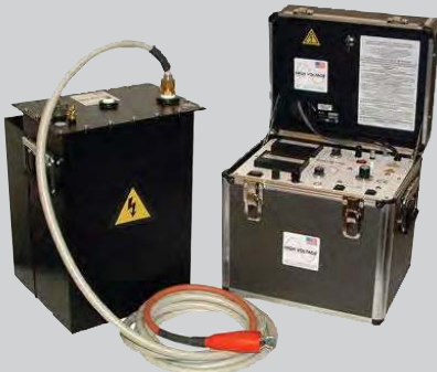
PTS-130 Model (0-130 kVdc, 10mA)